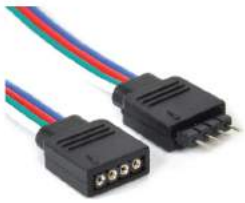
4PIN RGB (MALE & FEMALE) PLUG & SOCKET