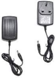
12V 3A ADAPTOR