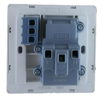
Product back view