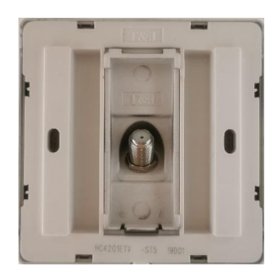
Product back view