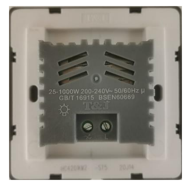
Product back view