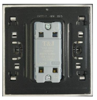
Product back view