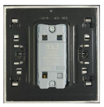
Product back view