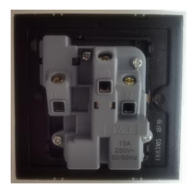
Product back view