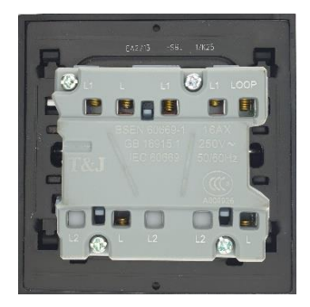
Product back view