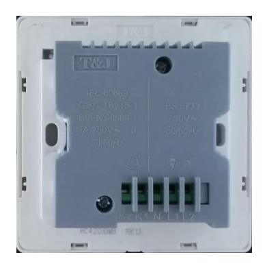
Product back view