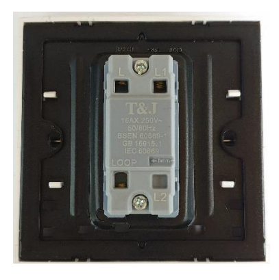
Product back view