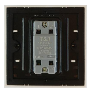
Product back view