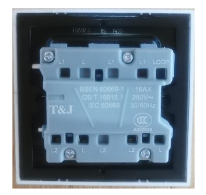
Product back view