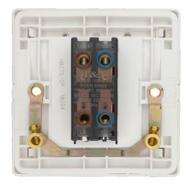
Product back view