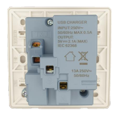
Product back view