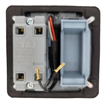
Product back view