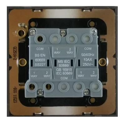
Product back view