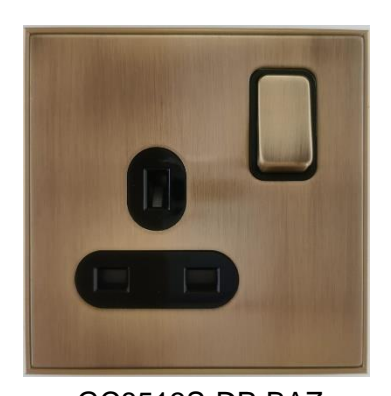
GC8513S-DP-BAZ (Black Interior, Antique Brass)