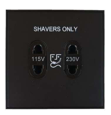
GC8568-BSBL face plate