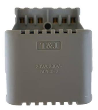
Transformer back view