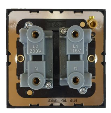
GC8568 back view