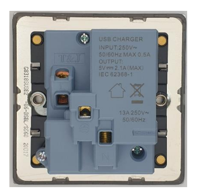
Product back view