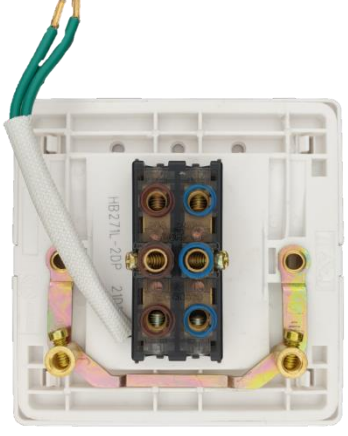
Product back view