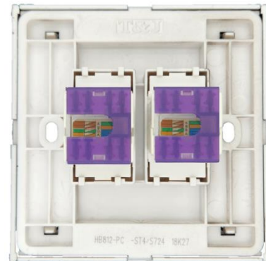
Product back view