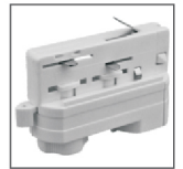
4 Line circuit