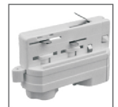
4 Line circuit