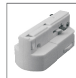
3 Line circuit