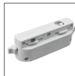
2 Line circuit