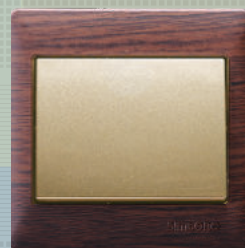
Champagne with Walnut Frame