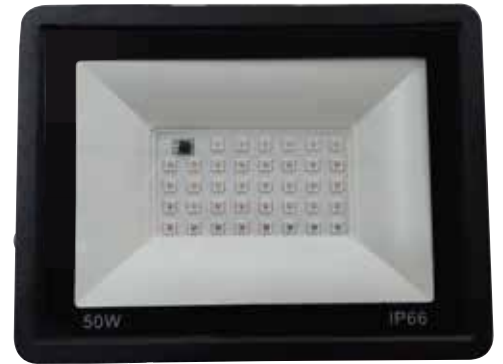
Size : 193mm x 147mm x 30mm