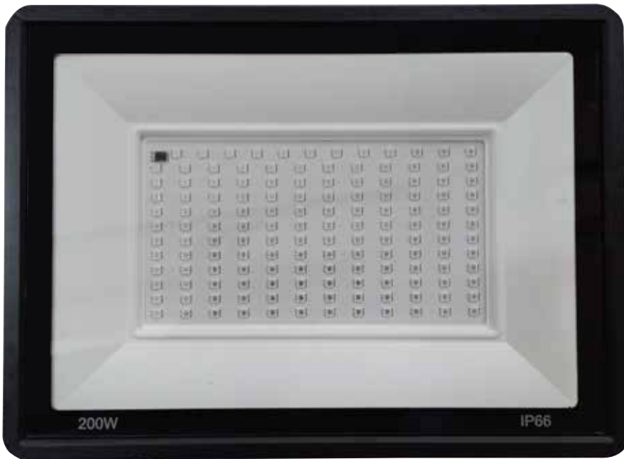
Size : 369mm x 270mm x 32mm