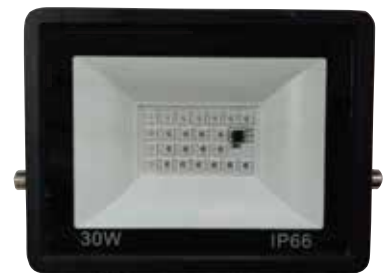
Size : 145mm x 110mm x 25mm