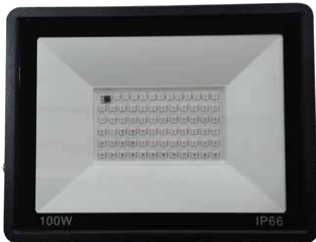
Size : 255mm x 195mm x 30mm