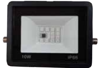
Size : 110mm x 86mm x 25mm