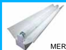
White Metal Reflector