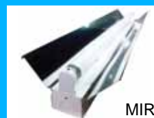
Anodized Aluminium Reflector