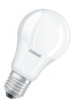
Value Classic A (E27)