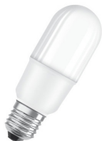
Value Stick (E27)