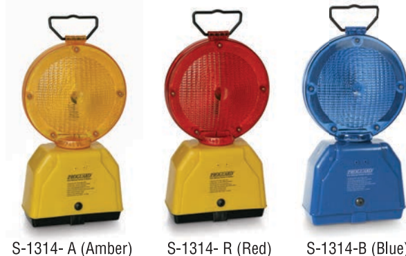
S-1314- A (Amber)