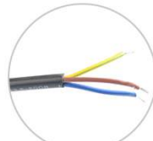
Sicker silicon cable