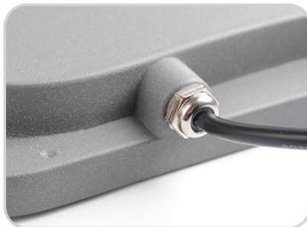
High quality waterproofing