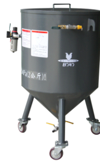
Abrasive delivery system