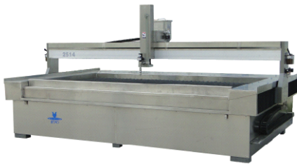
Gantry cutting table