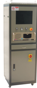
CNC Controller System