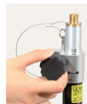
▲ Screw Lock