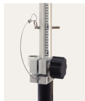
▲ Pin Lock (every 20cm)