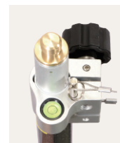
▲ Circular level (Built-in)