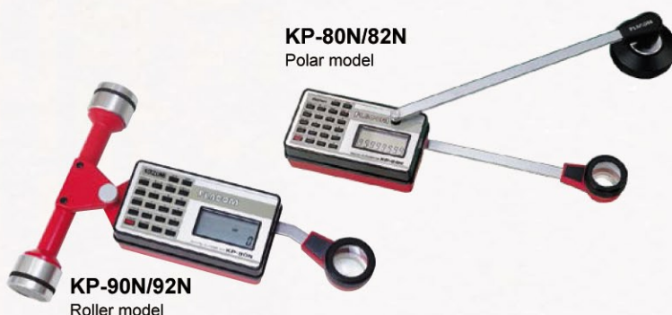
KP-80N/82N Polar model