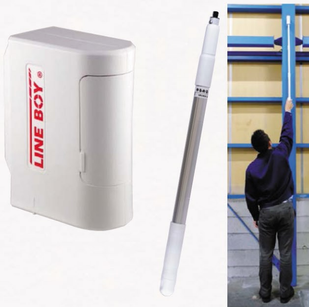
Extension pole (DPV03 only)

Pendulum laser bring the right vertically.