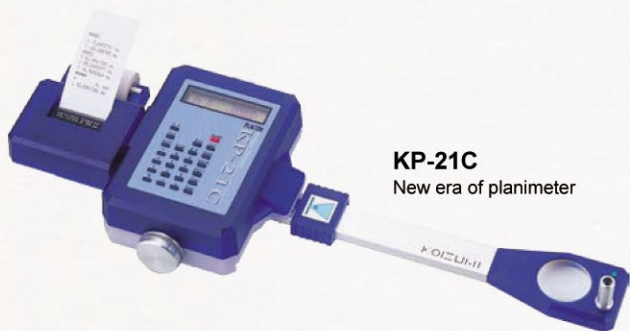
KP-21C New era of planimeter

Advanced features for exceptional cost performance meet all of your present and future needs.