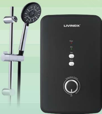
LWH-ARIMA DC-MB MATT BLACK WATER HEATER WM : 590 EM : 620