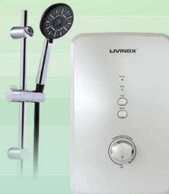
LWH-ARIMA DC-PW PEARL WHITE WATER HEATER WM : 590 EM : 620