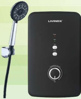
LWH-ARIMA E-MB MATT BLACK WATER HEATER WM : 335 EM : 373