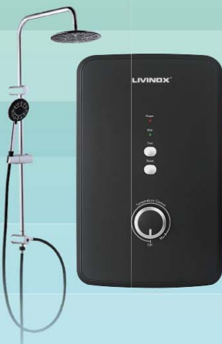
LWH-ARIMA DC-RMB MATT BLACK CW RAIN SHOWER WATER HEATER WM : 790 EM : 830