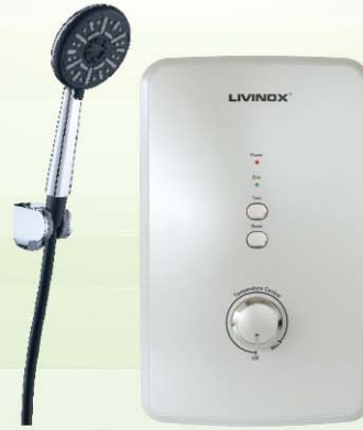
LWH-ARIMA E-PW PEARL WHITE WATER HEATER WM : 335 EM : 373