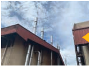
Another Option Installation of Chimney