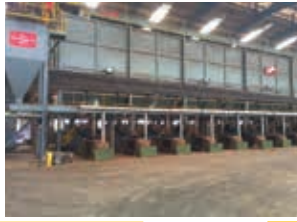
From Press to Ducting Pipe