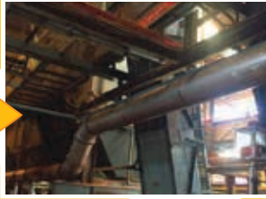
Ducting Pipe to Cyclone