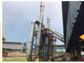
From Cyclone to Chimney