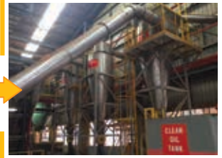
Cyclone, Air Lock to Chimney