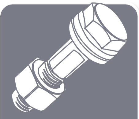
Seizure Prevention of Parts