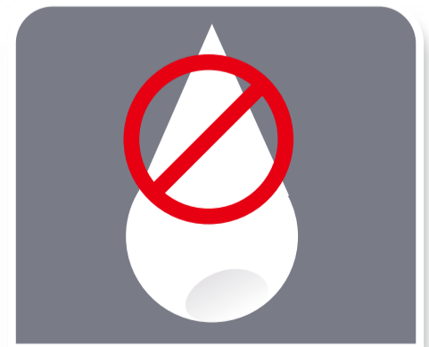
Locations Where Oil Use Is Prohibited

Applying a Lubrication Coating Over Sliding Surfaces of Parts Reduces Friction and Wear