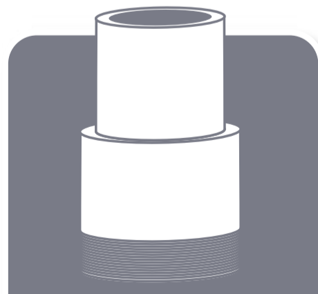
Friction Reduction on Sliding Surfaces