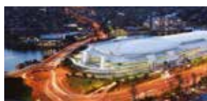
HOTELS & CONVENTION CENTRES