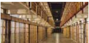
LAW ENFORCEMENT BUILDINGS