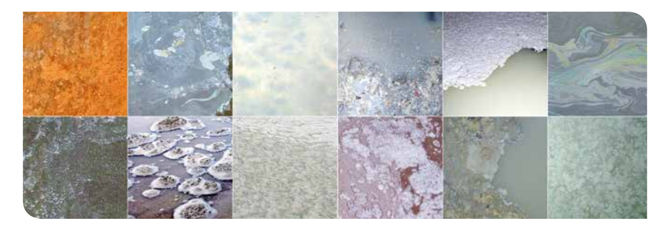
Whether you have to measure emulsified water from a flavouring production plant, industrial waste water in an aeration tank of a clarification plant or the waste water from dairies, paper or paint factories: The QuickCOD_{ultra} is very versatile and able to handle the most diverse applications and types of water.

With the right method, organic waste can be quickly measured without problems even in difficult waters with course material content.