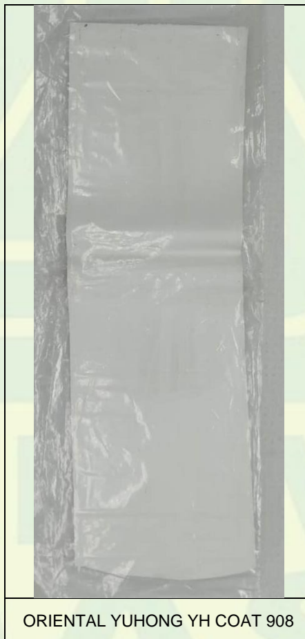
ORIENTAL YUHONG YH COAT 908