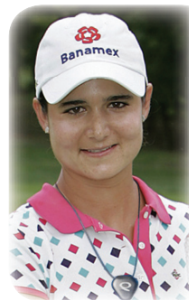
Lorena Ochoa #1 on Money List

With the US-based health jewelry sales in the past ten years reaching over $50 million, the results were surprising: newcomer Shuzi performed best, better than supposed market leader Q-Ray. After following each product's instructions on proper usage, we got tested by a certified professional on the BioMeridian machine – first without any health jewelry to get a baseline, and subsequently with each piece. The results were clear – only Q-Link and Shuzi reduced stress in my body. Because the Shuzi bracelet passed the BioMeridian assessment with flying colors and we really hadn't heard much about it, we thought it wise to delve a little deeper and find out more about our undisputed champion.