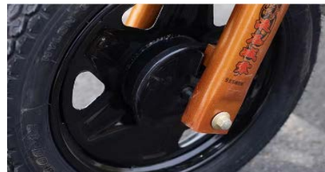
Black King Kong hub with quality assurance & scratch resistant