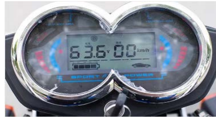
New high-definition LCD display screen with clear and bright