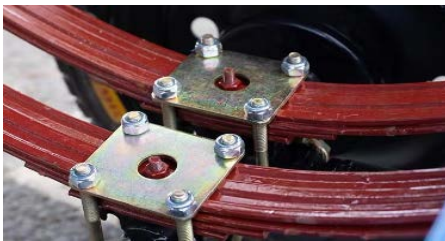
Two groups of strengthen, strong and durable steel plate for shock absorption.