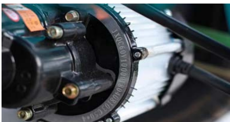
Motor with new magnetic steel design, optimize copper wire winding mode and density with improvement performance.