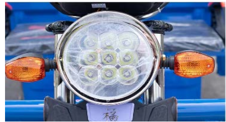
With six LED big bulbs to bring the brightness at the night.