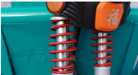
Stable and durable hydraulic spring shock absorption