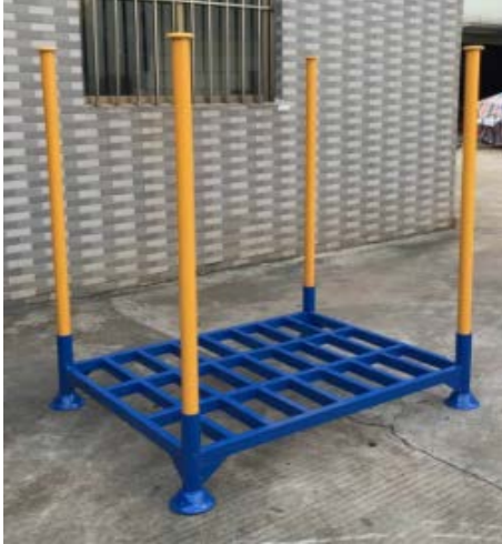
Fully Welded Type

The portable stack rack is preferred to common pallet rack for many applications due to its flexibility. It can be bulk stored with no aisles to save space on ono perishable items or condensed down and moved to a corner when not in use for seasonal items.