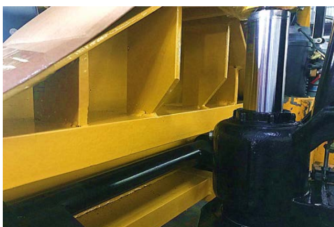
with reinforcement bar