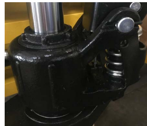
heavy duty hydraulic pump.