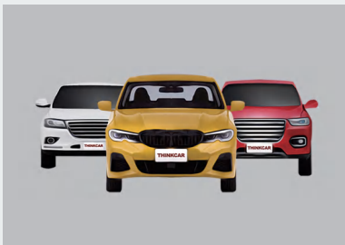
Wide Coverage (Support 98% car makes)