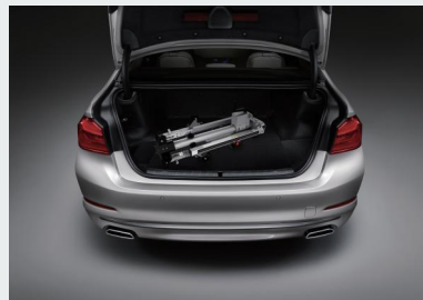
Foldable (Easy to carry)