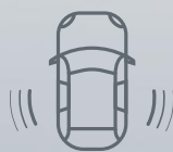
Adaptive cruise control