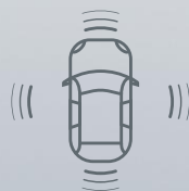
360° panoramic monitoring