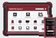
THINKTOOL MASTER 2