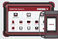
THINKTOOL MASTER X