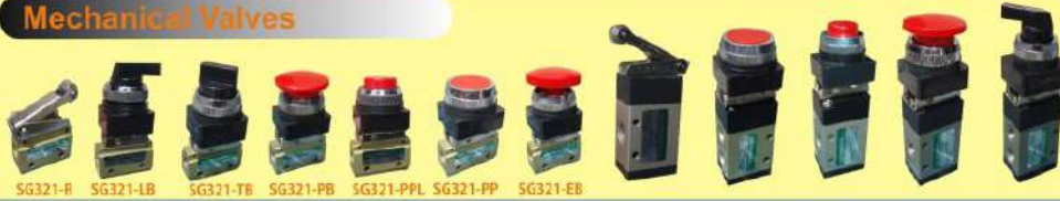
SG321-R SG321-LB SG321-TB SG321-PB SG321-PPL SG321-PP SG321-EB