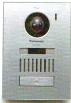
Door Station VL-V555