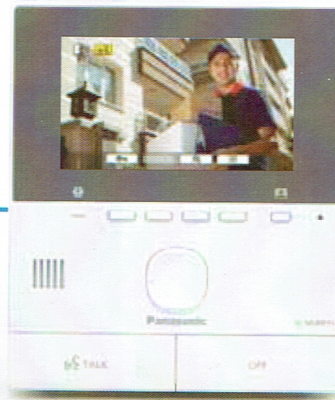
Main Monitor Station VL-MVN511