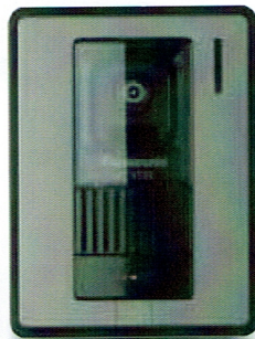
Door Station VL-V566