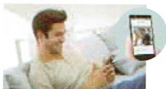
Answer Visitors and Unlock the Electric Locks

You can use your smartphone or tablet as a sub monitor to respond to visitors and unlock electric locks no matter where you are in the home. You can also monitor door station images when you want to check the door entrance.