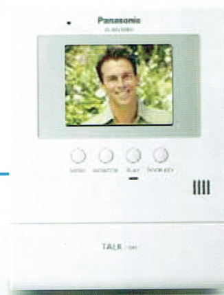
Main Monitor Station VL-MV30

* Easy installation by simply replacing existing doorbell unit Nonpolar 2-wire system.