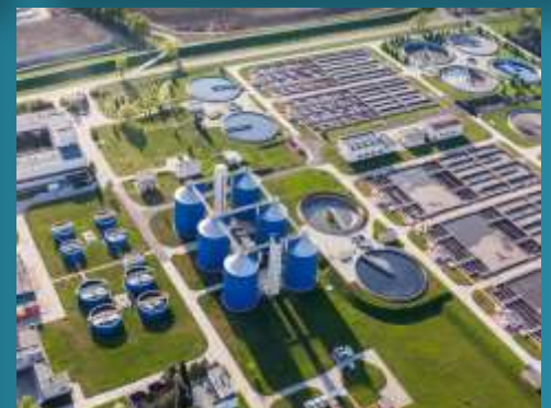
WASTE WATER TREATMENT

CUBEMAX RESOURCES (001891281-X) CUBEMAX REOURCES (M) SDN BHD (1373408-X)