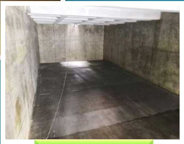
AFTER FRP LINING WORKS