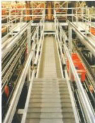
John Lewis Partnership - Access to truck parking conveyor system in warehouses.