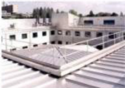
Access over gabled roof to air conditioning plant - Bath University