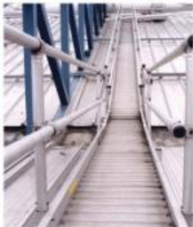
Glasgow Rangers F.C. Stadium Roof Walkway

Double width walkway in industrial laundry provides maintenance access to sewerage and prevents debris falling into machinery below.