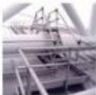
Custom designed steps can be provided to cater for alterations or changes in level.