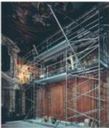
Towers can be bridged with Spandeck to provide large safe working areas.

Spandeck can be inverted and used in multiple combinations to provide decks and work platforms of virtually unlimited dimensions. The unique hook design allows Spandeck to be positively connected for multi-width use and also provide a positive location between towers or traditional scaffold systems.