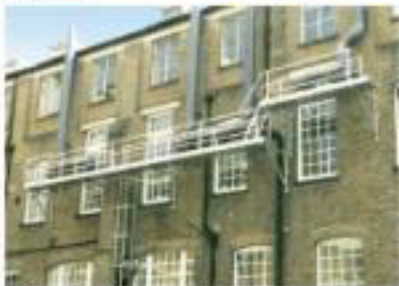
Wall bracket mounted access to tall pipes above bus Garage/Bus - City College, London.