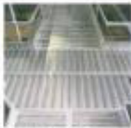
Four way intersection each piece are a standard option.

Deck systems are designed for use with standing seam roofing system clips.