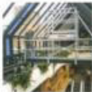
Walkways can be installed on roofs to provide mobile Access Services.

Providing full compliance, where applicable, with BS6399 (part 1) 1996 and BS5395 (part 2) 1995, subject to detailed specification, Spandeck Walkway systems are manufactured using procedures approved to ISO 9001. Our list of Worldwide client references speaks for itself, so if you need the highest quality and best price for a walkway make sure you contact us first.