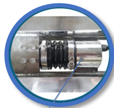
Water Proof Load Cell Cover