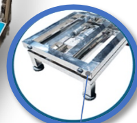
Fully Stainless Steel Structure