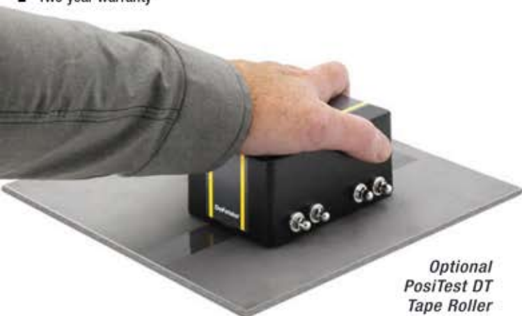
Optional PosiTest DT Tape Roller

Conforms to ISO 8502-3, AS 3894.6, US Navy PPI 63101-000